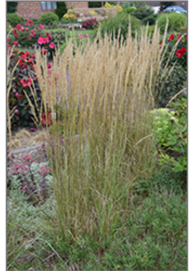
El Dorado Feather Reed Grass

El Dorado Feather Reed Grass is recommended for the following landscape applications;