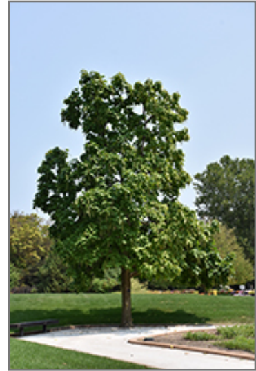
Northern Catalpa

Northern Catalpa is recommended for the following landscape applications;