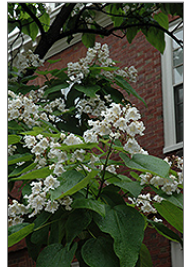
Northern Catalpa flowers