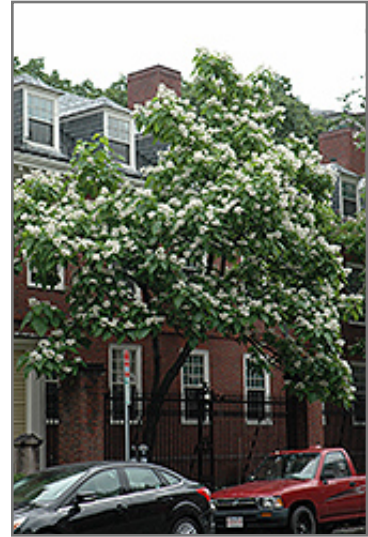
Northern Catalpa in bloom

This tree does best in full sun to partial shade. It is an amazingly adaptable plant, tolerating both dry conditions and even some standing water. It is considered to be drought-tolerant, and thus makes an ideal choice for xeriscaping or the moisture-conserving landscape. It is not particular as to soil type or pH, and is able to handle environmental salt. It is highly tolerant of urban pollution and will even thrive in inner city environments. This species is native to parts of North America.